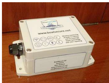
BoatSecure Monitoring onboard device